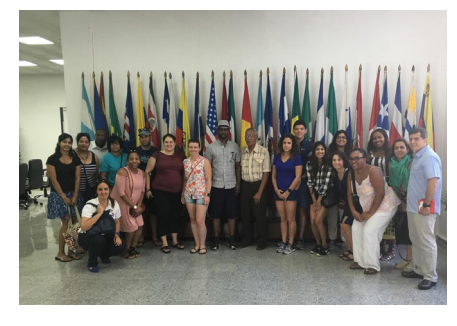
Mailman students gather at the Welcome Hall of ELAM, flanked by the national flags of students attending the school.

In September, 18 Mailman students and alumni embarked on a 6-day trip to explore the public health system in Havana, Cuba. Although usually led and attended by students in the Executive MPH program, participants in this year's trip also included 3 alumni from the Accelerated and Executive MPH programs and 8 friends and family, along with 7 current EMPH students.