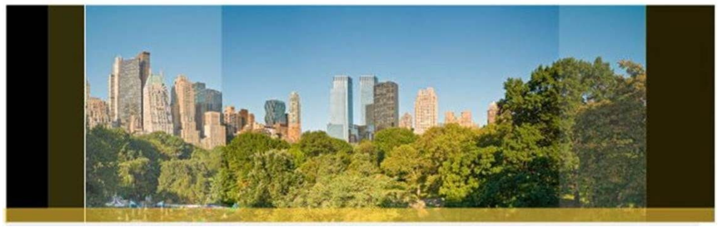
NEWSLETTER Volume 2, Issue 2

Department of Environmental Health Sciences